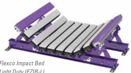
Flexco Impact Bed Light Duty (EZIB-L)