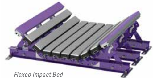
Flexco Impact Bed Medium Duty (EZIB-M)