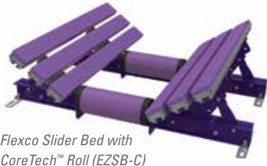
Flexco Slider Bed with CoreTech™ Roll (EZSB-C)