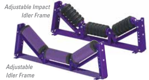
Adjustable Impact Idler Frame