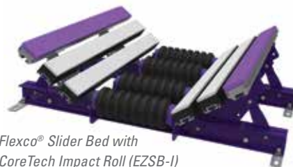
Flexco® Slider Bed with CoreTech Impact Roll (EZSB-I)